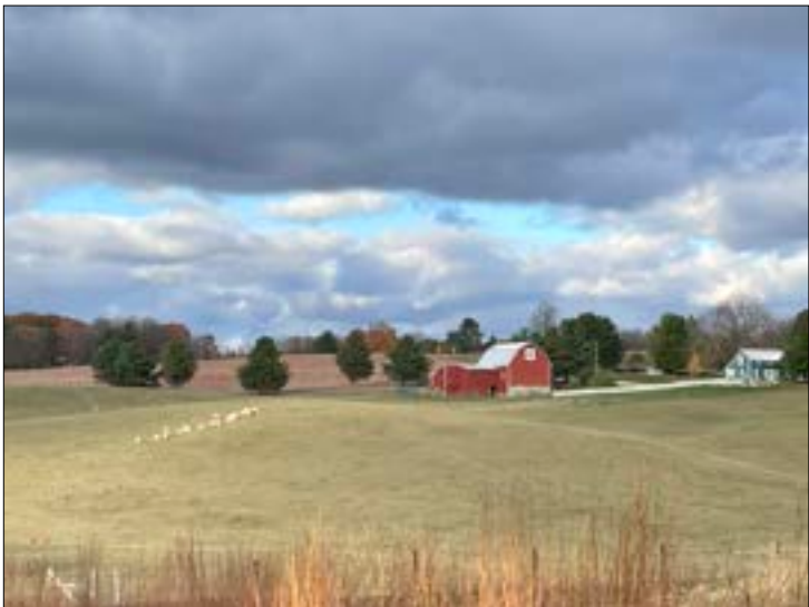
Plein-air painting classes will take place at Angell Farm.